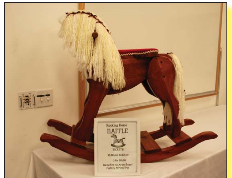
Auction Item for Boesl Humanitarian Trip