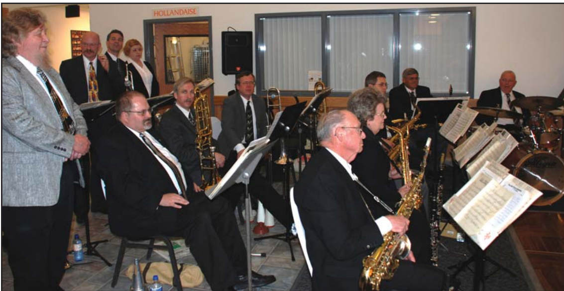
It's About Time Big Band