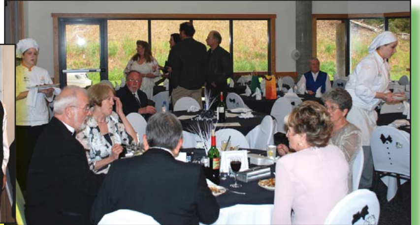
Interact Club Volunteers