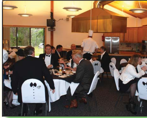
Chairbacks reflect the British Auction Theme.